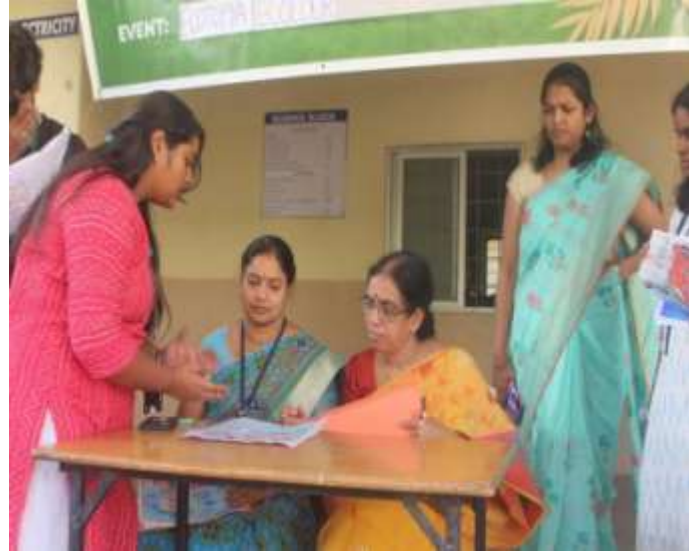
Judges observing the painting