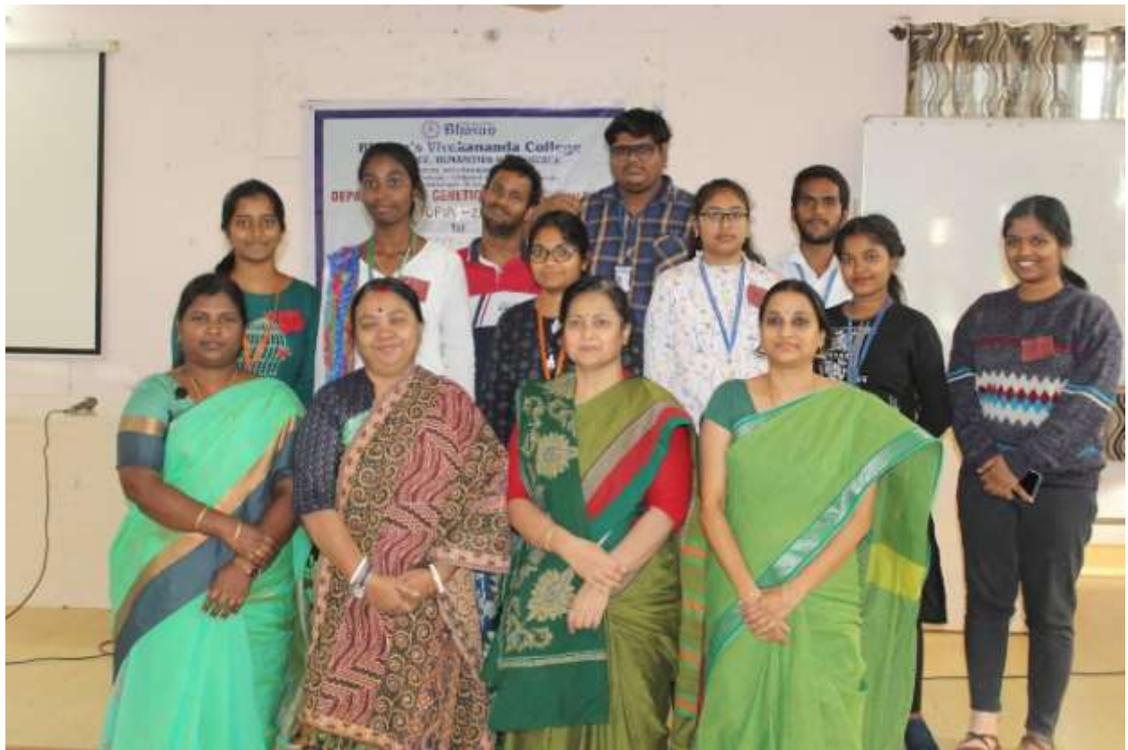
Team of Poster Delight (e-poster)