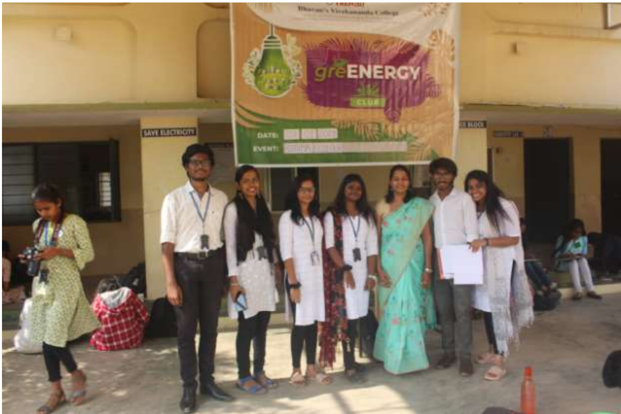
Team of Ecolor (painting)