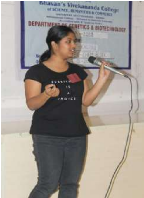
Participant of talk master