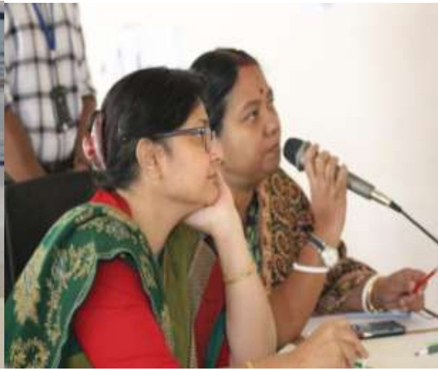
Judges interacting with participants