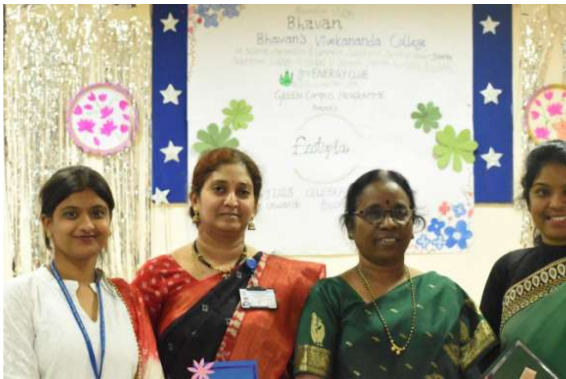
Participant (Elocution) Faculty incharge and Judges