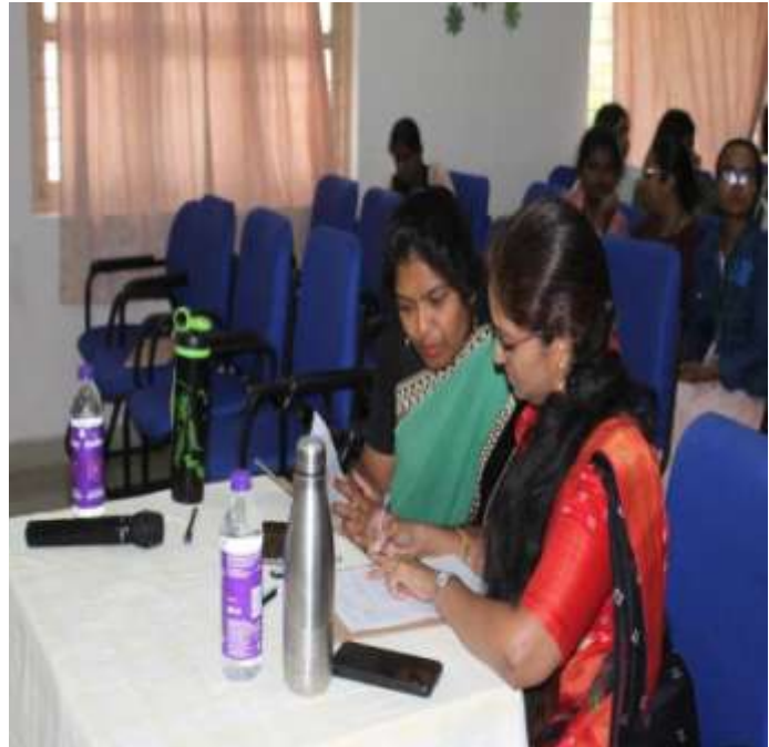
Judges evaluating the participants