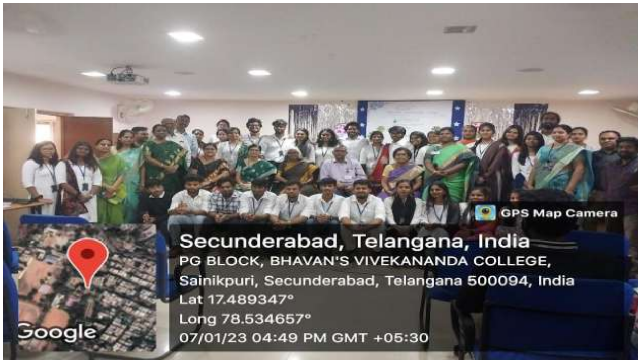
Team Ecotopia - 2