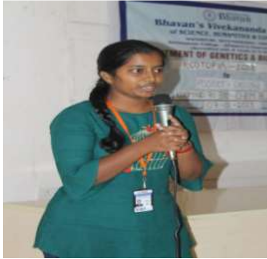
Poster Delight (e-poster) participant